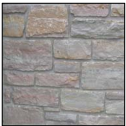
Heritage Blend Broke Rubble