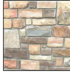
Cumberland Mountain Broke Rubble