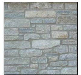
Lost River Broke Rubble Thick