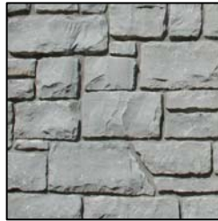
Flatrock Grey Rubble