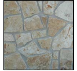
Brown County Web