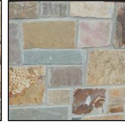
Cumberland Mountain Palace Blend