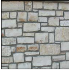
Antique Buff Splitface Rubble