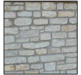
Flatrock Thin Rubble