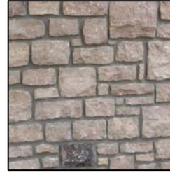
Aztec Brown Broke Rubble