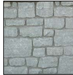
Flatrock Grey Tumbled Rubble