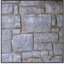
Colonial Blue Rubble