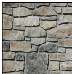
Rush Co. Broke Rubble