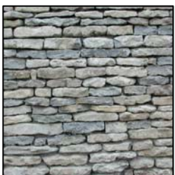
Lost River Broke Rubble Thin