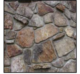
Cumberland Mountain Web