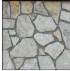
Antique Buff Web