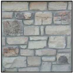
Cumb. MT Weathered Fieldstone Rubble