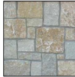
Flatrock Castle Cut