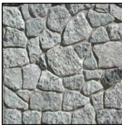
Horse Creek Handpicked Web