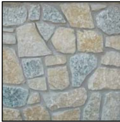
Flatrock Web Full or mini sized