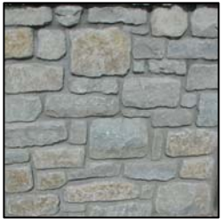
Flatrock Tumbled Rubble