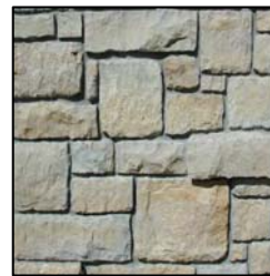
Laurel Buff Rubble