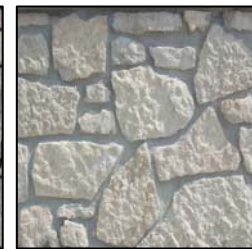
Laurel Buff Web