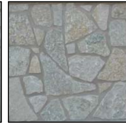
Flatrock Grey Web