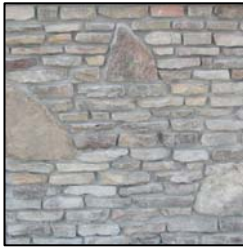
Cumb. MT Weathered Fieldstone Thin Stack