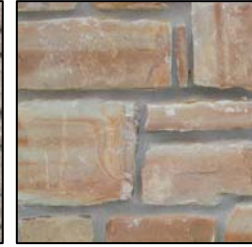
Brown County Rubble