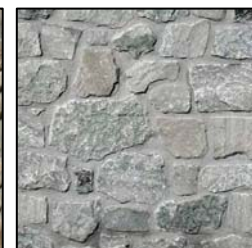
Western Grey Hunk & Chunk