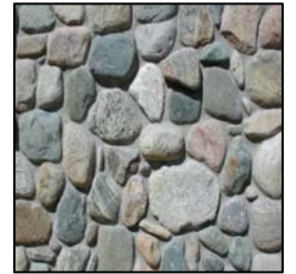
Glacial Granite Cobbles