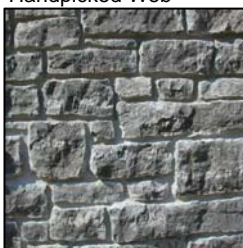
Old South Broke Rubble