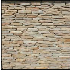
Chestnut Thin Stack