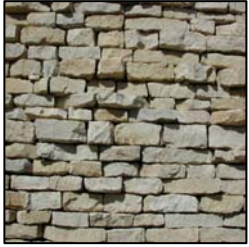
Antique Buff Dry Lay