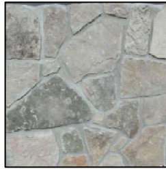
Cumb. MT Weathered Fieldstone Web